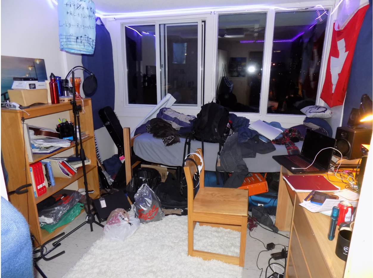
Justin Sports Communist Red Flag in Room