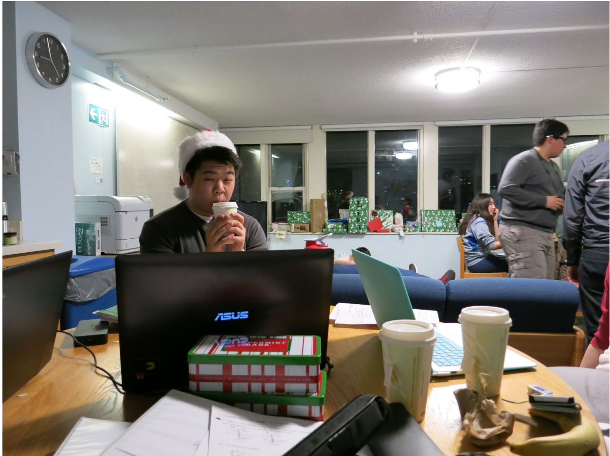
Basically this guy is on drugs and he is definitely feeling the effects. That damn charizard thing probably sold him the stuff.